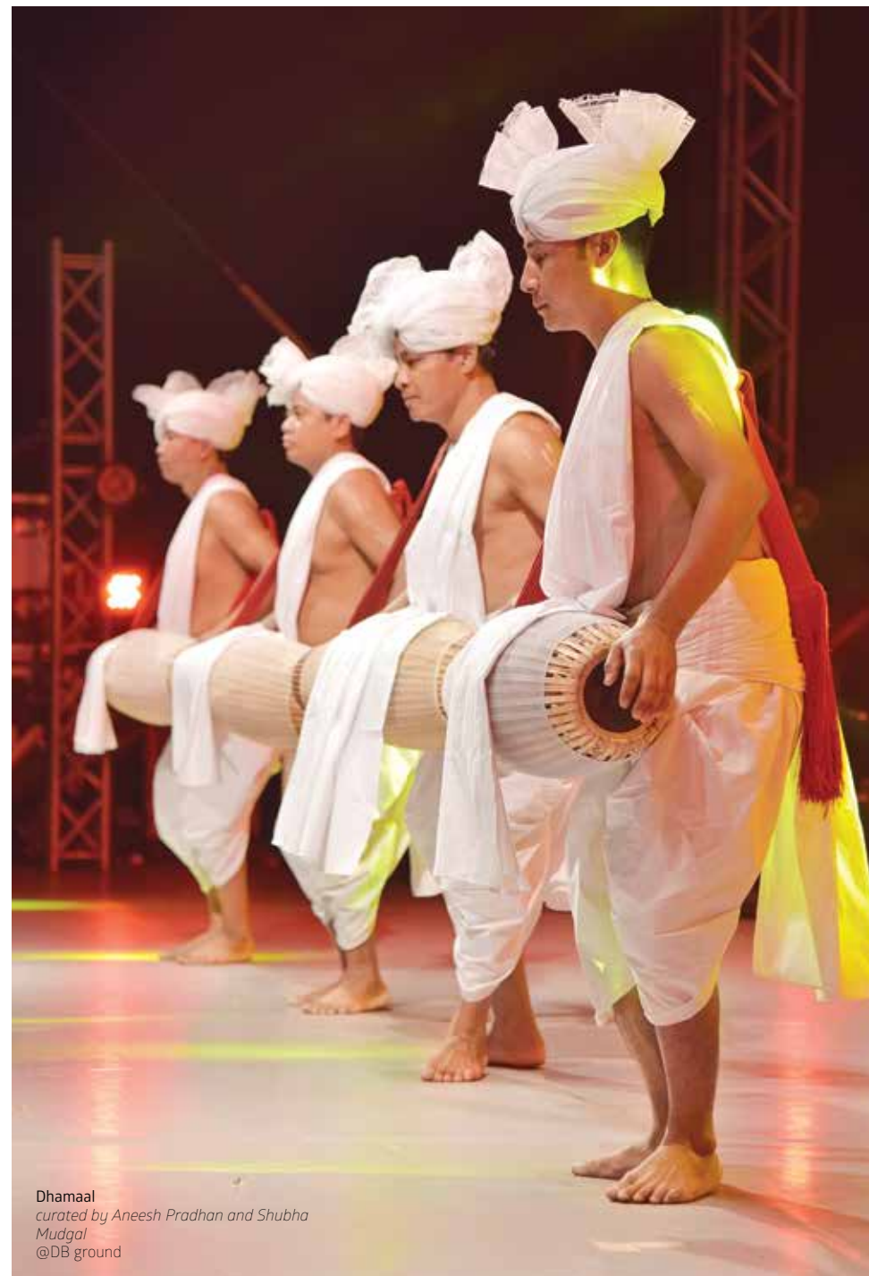
Dhamaal curated by Aneesh Pradhan and Shubha Mudgal @DB ground