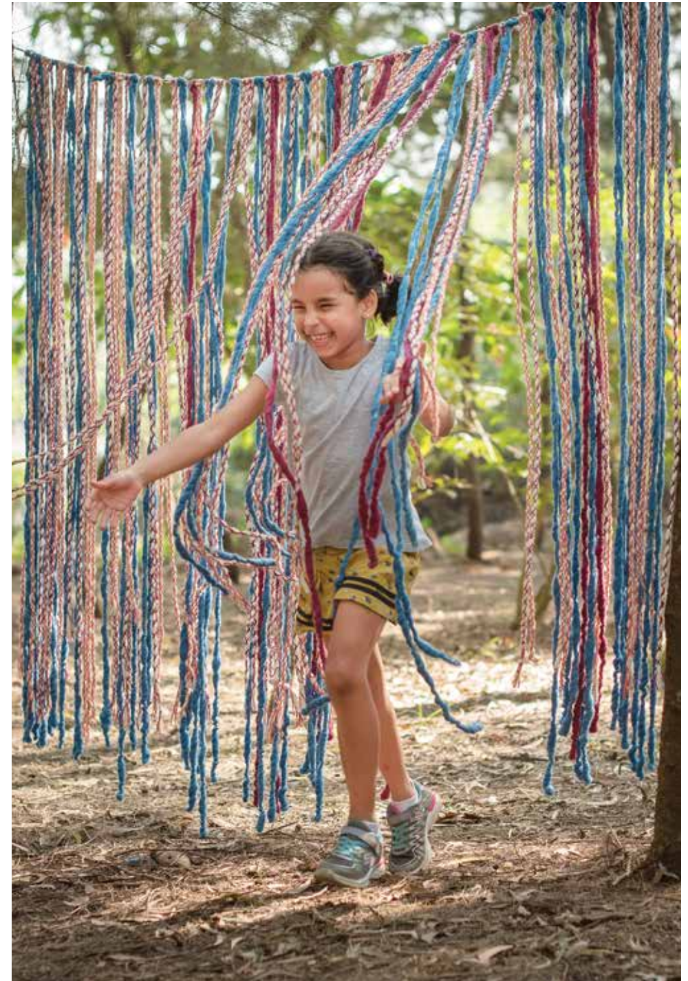
YARN BOMBING by Raj Art Initiative @Art Park